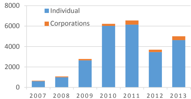
Figure 1: Number of donors cooperated with TGE

In February 2014, a brochure on taxation of cross-border philanthropy in Europe was published by TGE in collaboration with the European Foundation Centre. Detailed national profiles may be downloaded from www.maecenata.eu/laenderprofile