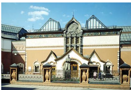
Picture 5: Tretyakov gallery and monument of Pavel Tretyakov, Moscow.

Nonetheless, the focus of philanthropic commitments was not limited to social issues. The support of art was also very common type of engagement among philanthropist during the turn of the century. One of them, Savva Mamontov dedicated his villa in Abramtsevo, located near Moscow, to become a centre of arts. Many outstanding Russian painters of the beginning of 20th century lived and worked there, e.g. Ilya Repin, the Vasnetsov brothers, Vasily Surikov, Mikhail Vrubel, Valentin Serov. Together with his wife Elizaveta, Savva Mamontov organised several talent workshops to support popular art in Russia.