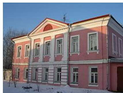
Picture 2: Poorhouse in Dmitrov, built at the beginning of the 19th century

In 1884, the wealth of all the Departments of Maria's Institutions were marked with 90,000,000 Roubles collected from 595 documented donations. In 1902, the department comprised 1,000 establishments, including two educational institutions, about 200 orphanages, and a number of special educational organisations such as 21 colleges for blind and one for the deaf-mute