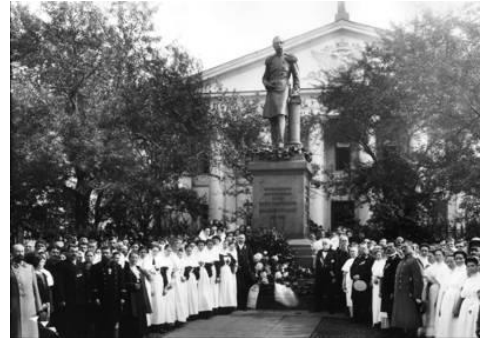
Picture 4: Foster children and medical staff next to the Petr Oldenburgsky memorial, centenary of his birth, St. Petersburg 1912.

In general, it became a good tone to be involved in philanthropic activity. The humanitarian attitude of the Imperial Family was a great example for other aristocratic families and wealthy individuals to be more involved. As a result, patronages and private foundations were blooming in this period. Entire families supported some philanthropic actions, e.g. the Oldenburgsky dynasty, in which the male family members established hospitals, educational institutions,