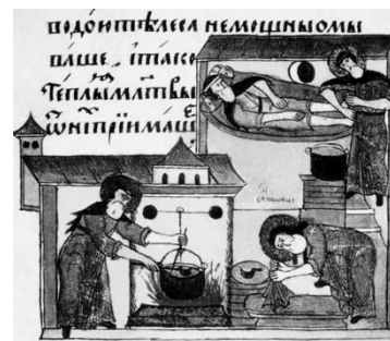
Picture 1: Illustration of the text "Lives of Saint Antoni Siiski" from 1648, showing him taking care of the ill and unable.

This development of the charitable tradition in Rus faced difficult times during the Mongol-Tartar invasion in the beginning of the 13 th century. For almost 150 years, Rus was ruined and destroyed, weakened financially, morally and culturally under the regimen of the Golden Horde from 1238 until 1380. During this time, violence, cruelty and anarchy became part of daily life, destroying national habits, humanity and moral norms. However, for the duration of supremacy of the Golden Horde, the church took over the major role in charitable actions. The charitable actions of the church were made possible through the fact that at least during the first half of its domination in Rus, Tatar Khans had dismissive attitudes towards the Orthodox Church,